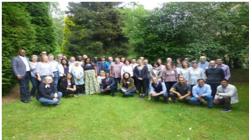
Group photo of all participants from the 4th International CITES workshop.