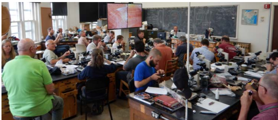
Attendees focused on (pun intended) light microscopic identification of North American structural timbers.